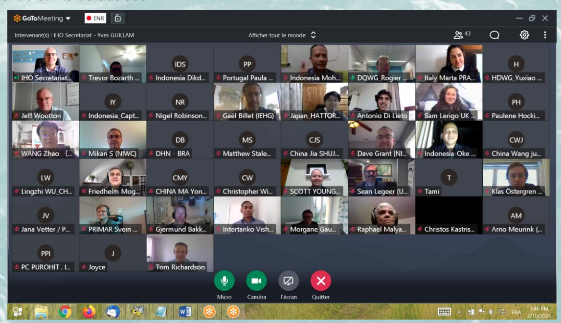
Participants in the DQWG-16 VTC meeting

The next meeting of the DQWG is planned from 8 to 11 February 2022 with the location and venue still to be decided.