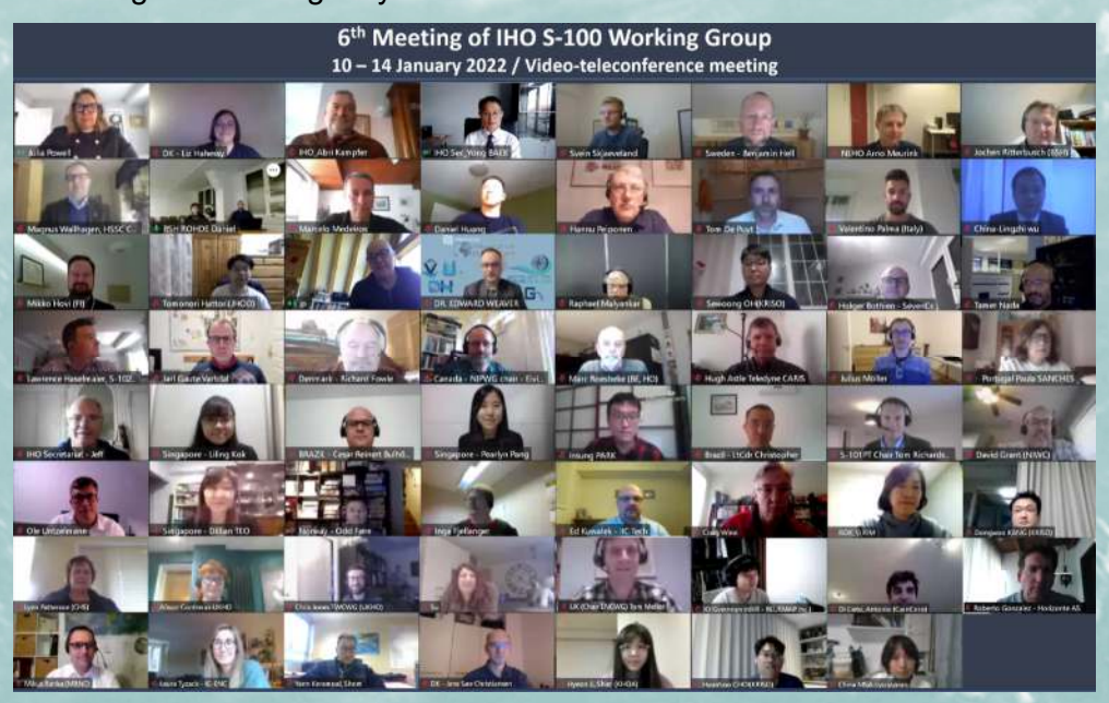
Some participants at S-100WG-6

The Chair opened the meeting informing participants that due to the VTC format, the discussion items focused on proposals for S-100 Edition 5.0.0; S-98 Edition 1.0.0; S-102 Edition 2.1.0; and the Dual Fuel Governance Document, with other remaining items to be considered during the meeting only if time allowed.