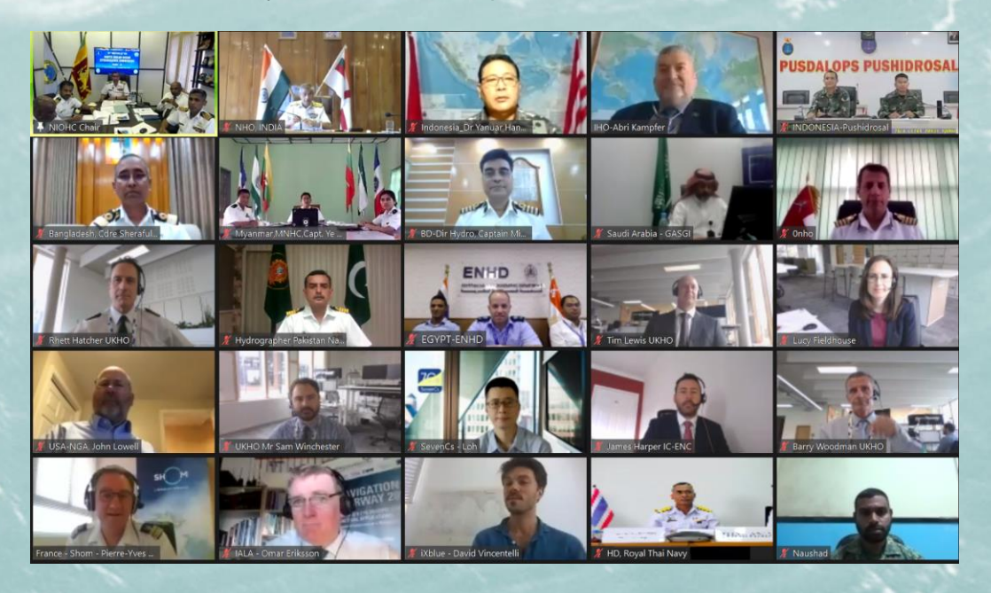
Some participants of the NIOHC20 Conference.

Indonesia, the current Vice-Chair of the NIOHC, will assume the Chair of the NIOHC within the next four months in accordance with the Statutes of the Commission. There were no nominations for the Vice-Chair position. The next meeting venue and date will be decided once there is more certainty on the available options.