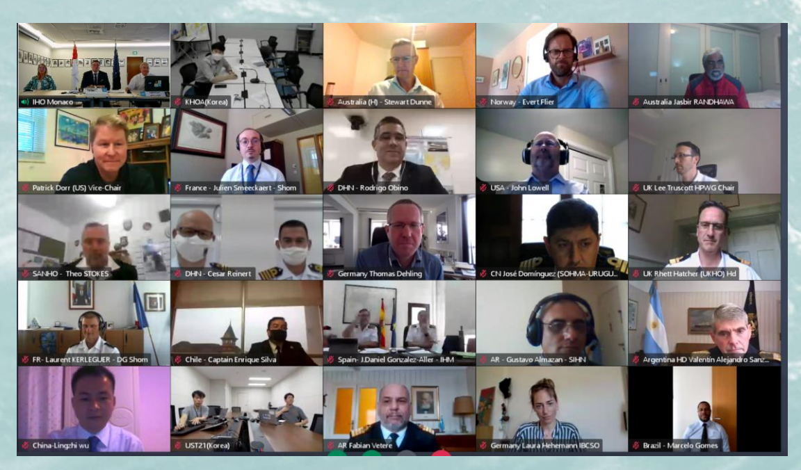
Some of the participants of HCA-17

Noting the 3<sup>rd</sup> Session of the IHO Assembly in April 2023, the Chair proposed that the 18<sup>th</sup> Conference of the IHO Hydrographic Commission on Antarctica be held in 2022, and the 19<sup>th</sup> Conference in 2024. The 18<sup>th</sup> Conference was planned to be arranged in conjunction with ATCM XLIV 2022 which is expected to take place in Berlin, Germany.