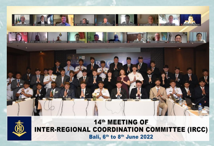
Some participants at IRCC14

The HSSC chair presented the progress on the S100 Roadmap, highlighting that the operational edition of S-101 will be ready in 2024. HSSC endorsed the draft Ed.1.0 of the governance document, named Dual-Fuel Concept for S-100 ECDIS, ready to be endorsed by C-6 and then submitted to A-3 for approval. He also highlighted the importance of next NCSR meeting to introduce the S-100 in the IMO regulations, critical to the success of the Roadmap of the S-100 Implementation Decade. HSSC agreed that the term "Hydrospatial" is not a technical term so it shall not be included in the Hydrographic Dictionary and will consider the requests from the IHO e-Learning centre for providing contents, as appropriate.