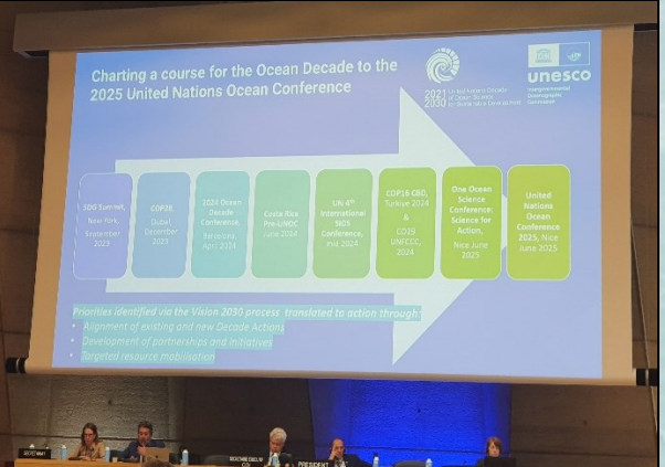
Presentation of the updates on Decade Implementation plan