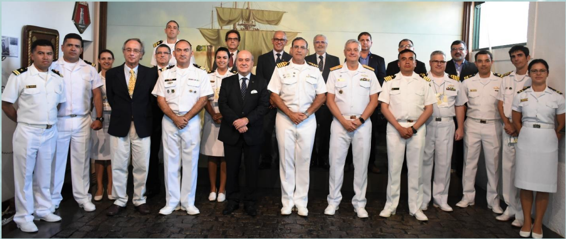
Participants of the SWAtHC14 meeting.