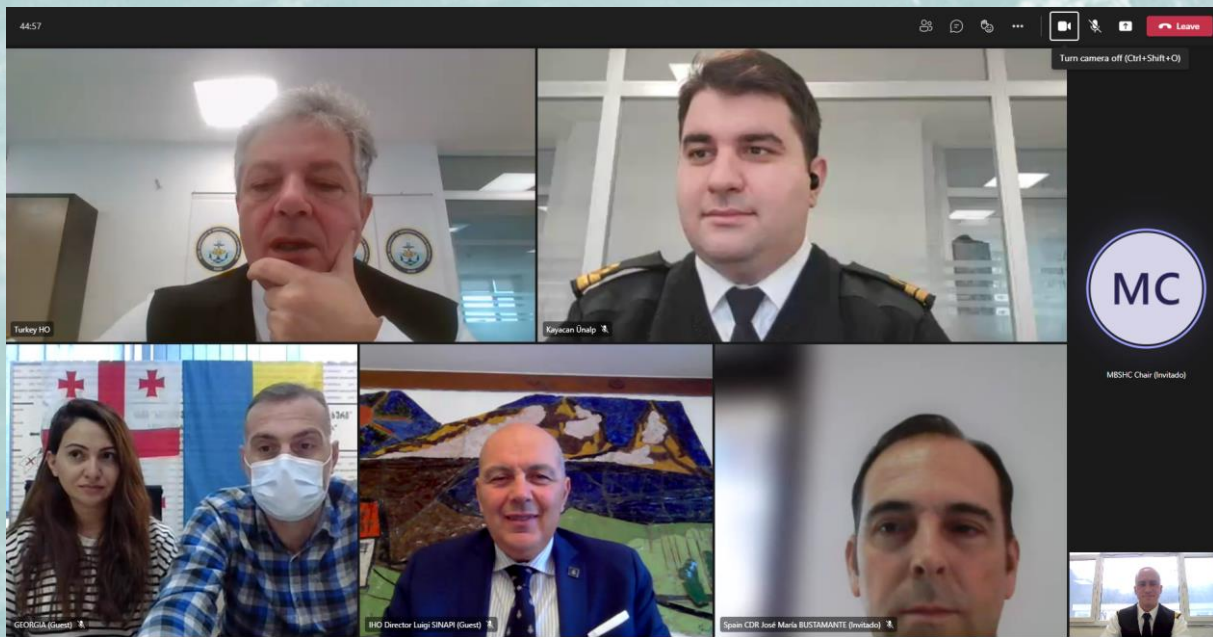
Participants of 16 th Black and Azov Sea Working Group VTC

At the end of the meeting, it was unanimously agreed that Turkey will continue as the BASWG Chair for the next two years, and that the next BASWG17 meeting will be held in Istanbul (dates will be defined after the MBSHC23 meeting).