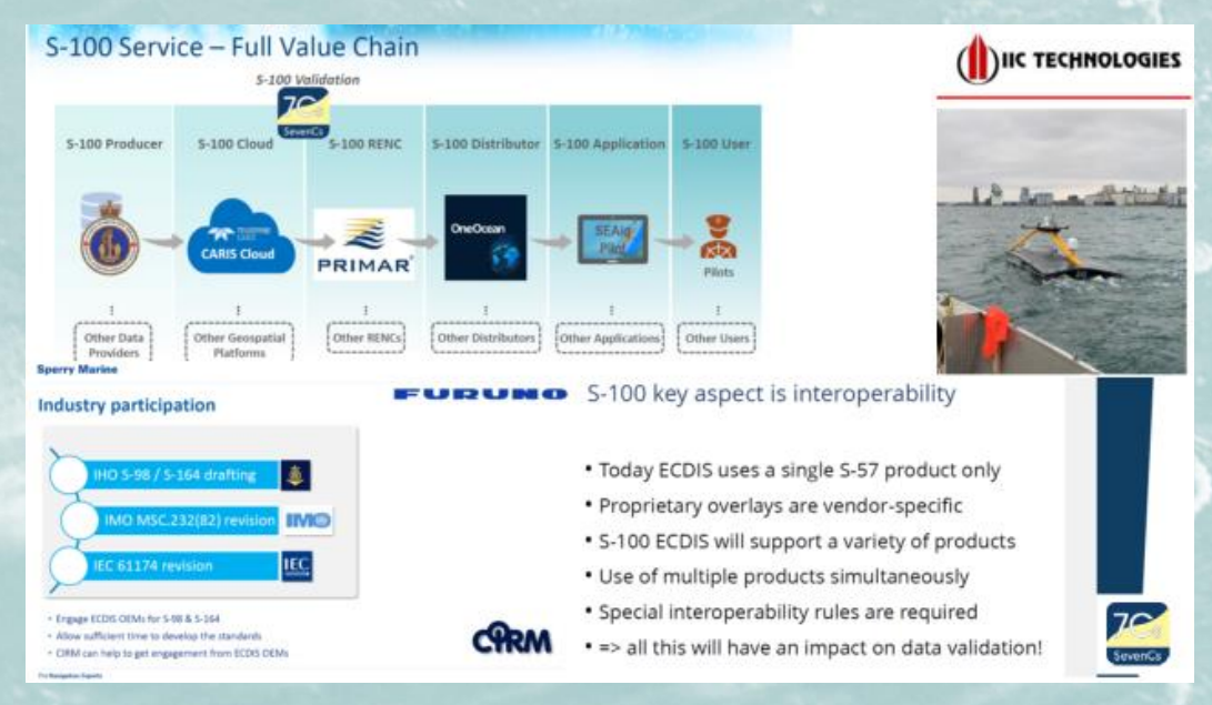
Compilation of some key topics and issues addressed at the IHO Stakeholders' Open Session

The IHO Stakeholders' Open Session was supported by 5 enlightening presentations aiming to provide the state-of-the-art of technology and innovation in support of hydrographic activities. The presenters also shared their vision on the new challenges for the validation of S-100 based products and their use on board ships. They also raised the awareness of HSSC Members and Working Groups on the best way to manage the transition in order to ensure that the regulatory environment can be formed to allow the benefits of S-100 to be realised in a safe and timely manner.