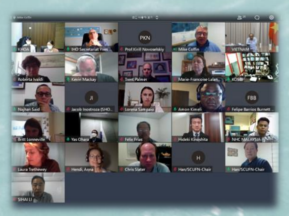
Participants in SCUFN-33