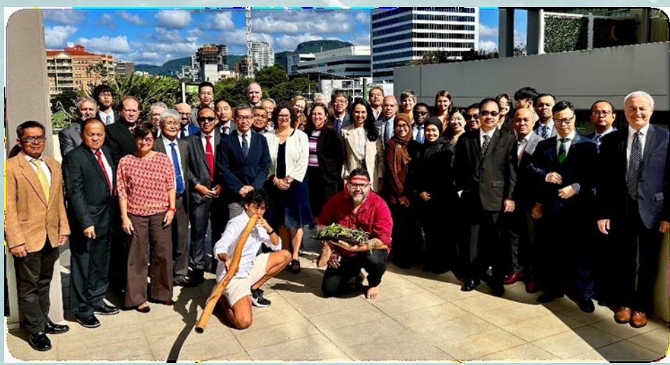
Participants in SCUFN-36 – Opening Ceremony

The Chair opened the meeting noting that SCUFN had another significant challenge to face this year with about 450 naming proposals<sup>7</sup>, a record in the history of SCUFN. Despite the procedure in force through the pre-review by SCUFN Members of the naming proposals, thanks to the SCUFN Operational Web Services (operated by KHOA), and the pre-loading by the Secretariat of all naming proposals on the GEBCO Gazetteer<sup>8</sup>, there was a huge risk to be obliged to defer a significant number of proposals. To prevent SCUFN from facing this situation again in the near future, the Secretary suggested to cap the number of naming proposals per organization/country (25 max.) and per year for SCUFN meetings in total (250 max.). This new rule "25/250" was adopted unanimously with immediate effect after SCUFN-36. Proposed amendments to the ROPs will be prepared accordingly and submitted to the GGC<sup>9</sup>.