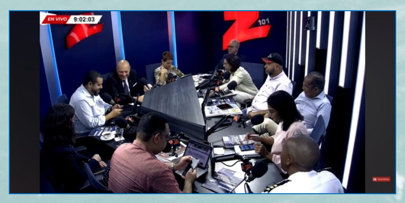
Interview with radio station Z-101

At the end of the individual meetings with the above-mentioned authorities, the commitment of the national Hydrographic Service at Ministry of Defence level was confirmed, as well as the full willingness to financially support the development of the country's hydrographic capabilities, to approve new legislative instruments to consolidate the role of the Hydrographic Office at a national level, and finally - on the part of the Constitutional President of the Dominican Republic - to urgently initiate a plan to strengthen the equipment necessary to carry out hydrographic surveys through new funding.