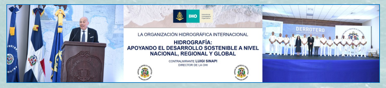
Conference to the Armada officers and Dominican Government representatives

which included high level hydrographic personnel serving in the Hydrographic Office, many of whom were certified by institutions that are recognized hydrographic and cartographic courses.