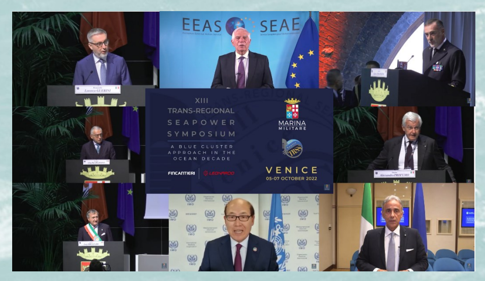
XIII T-RSS opening ceremony

dynamics of security and economic sustainable growth. In fact, in a systemic, international and multi-domain perspective, it is envisaged to identify, develop and share possible solutions to issues of common interest through an interdisciplinary governmental and policymakers' approach to achieve proper action focus and full effectiveness in favour of the international maritime community.