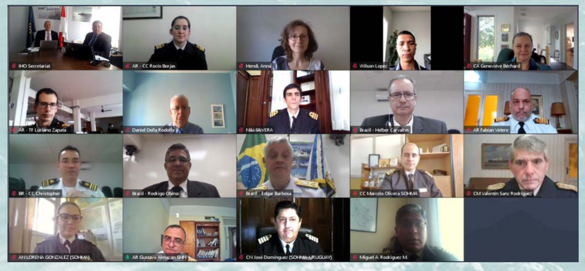
Participants of the SWAtHC15 meeting.

the IHO Centenary celebrations and the recent launch of the new IHO website of the International Hydrographic Review (IHR).