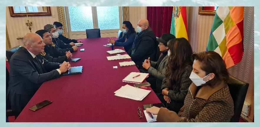
Meeting at the Ministry of Foreign Affairs