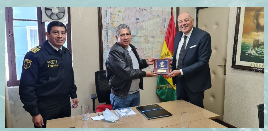
Meeting with the Minister of Defence – Av. Edmondo Novillo Aguilar