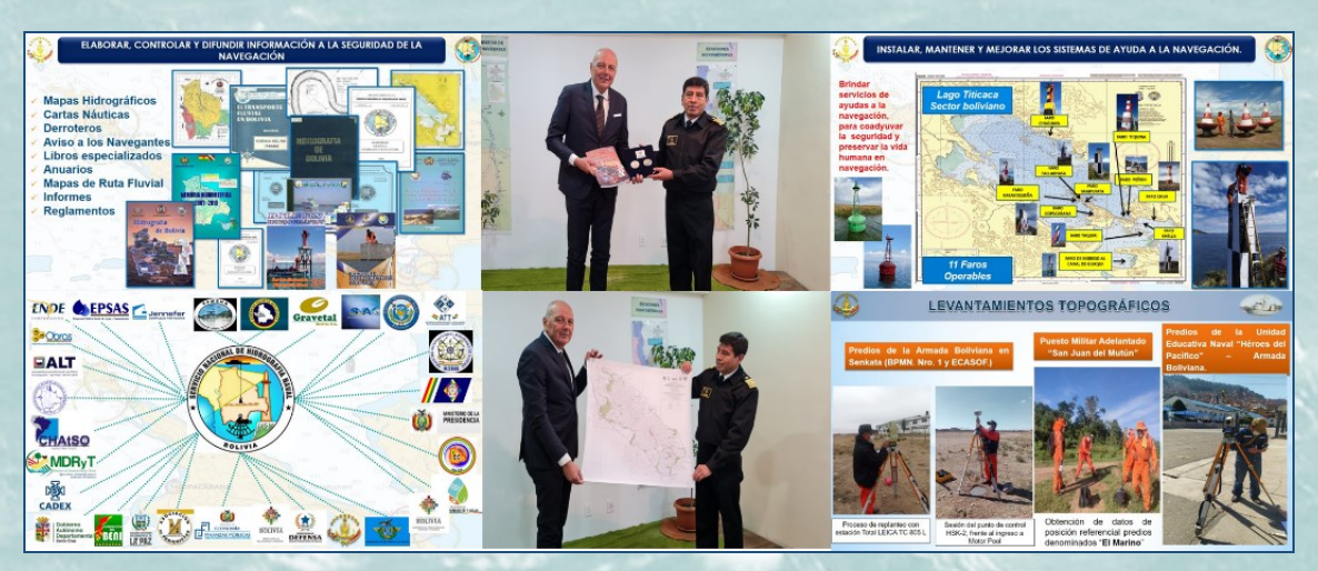
The SNHN activities

The Plurinational State of Bolivia has a Hydrographic Service capable of ensuring, by means of up-to-date cartographic products complying with international hydrographic and cartographic standards, the safety of navigation in Lake Titicaca and navigable inland waterways, in cooperation with the neighbouring States of South America, and actively participates in the work of the South West Atlantic Hydrographic Commission (SWAtHC) as an Observer. The bathymetric updating and production of traditional and electronic nautical cartography contributes to the safety of navigation and development of the country's port infrastructures, complying with the IHO's international hydrographic and cartographic standards.