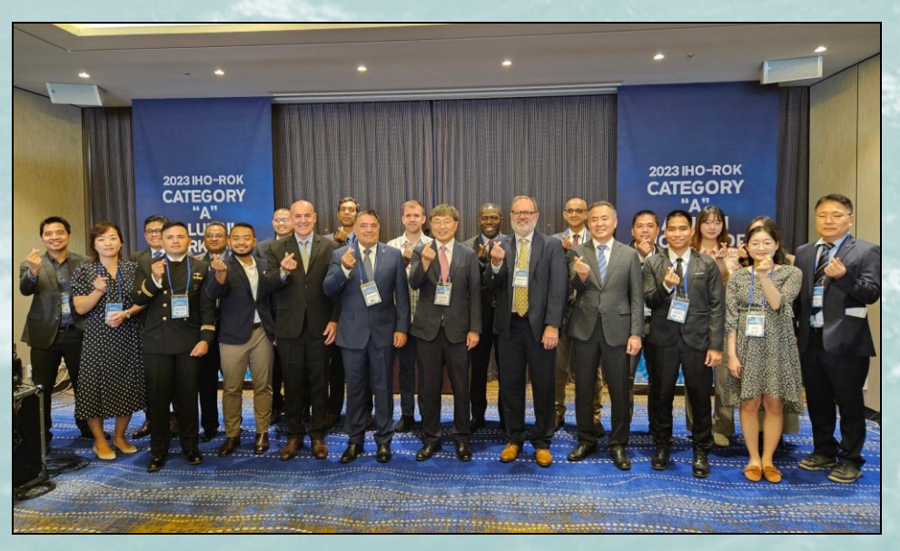
Participants at the IHO-ROK Cat. A Alumni workshop