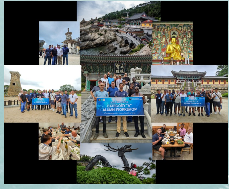
Alumni on cultural visits to Busan and the banquet offered by the KHOA

The morning of the 2<sup>nd</sup> day of the Workshop focused on technical presentations about the "Mauritius Hydrographic Service", the "National Hydrographic Office challenges and future directions", the surveys using "Photogrammetry and LIDAR techniques and the comparison of the data obtained", the "S-100 application status and plan in hydro and maritime safety domain in Korea" and finally the "Importance of MSDI". The presentations fuelled a constructive discussion among those present, highlighting the differences in approaches and views of representatives of Hydrographic Services.