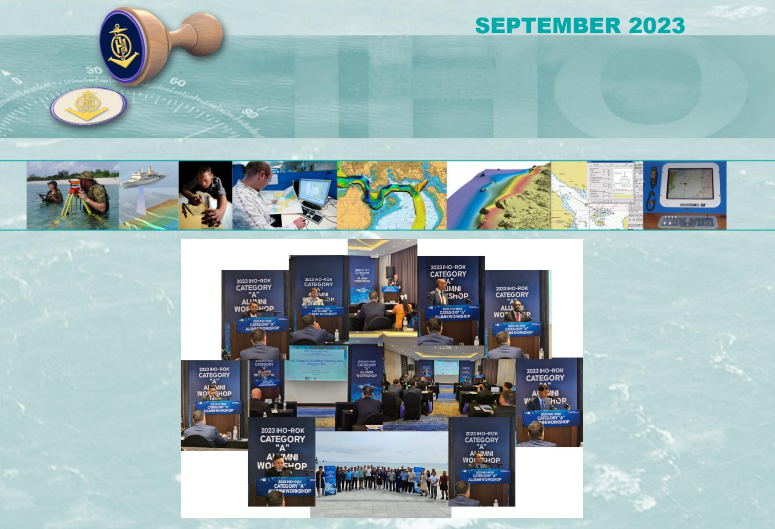
Participants at the Workshop inside and outside the Paradise hotel in Busan (ROK)

The morning of the 2<sup>nd</sup> day of the Workshop focused on technical presentations about the "Mauritius Hydrographic Service", the "National Hydrographic Office challenges and future directions", the surveys using "Photogrammetry and LIDAR techniques and the comparison of the data obtained", the "S-100 application status and plan in hydro and maritime safety domain in Korea" and finally the "Importance of MSDI". The presentations fuelled a constructive discussion among those present, highlighting the differences in approaches and views of representatives of Hydrographic Services.