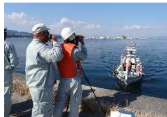
one-month field survey training

The participants are also taught data processing using GIS software to utilize hydrographic data, and visit several factories and research institutes to see state of the art technology and also visit the damaged areas of the 2011 tsunami disaster in Japan to see restoration activities and disaster management for future disasters.