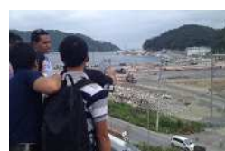
visit to tsunami devastated area