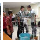
visit to company dealing with survey instruments