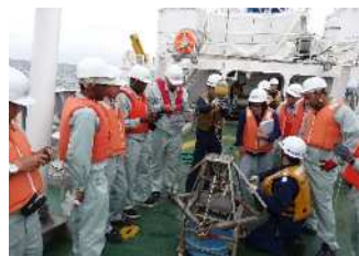
on-board training on JHOD's survey vessel