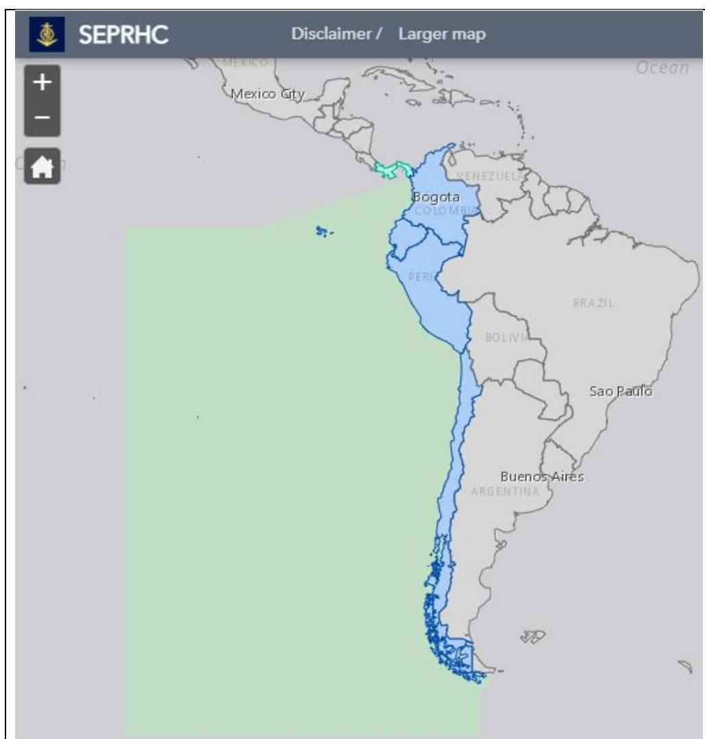
Figure 1.- Region and Commission country members

The Southeast Pacific Regional Hydrographic Commission is integrated by: Chile, Colombia, Ecuador and Peru, in addition to the participation of Panama, as an observer (Figure 1).