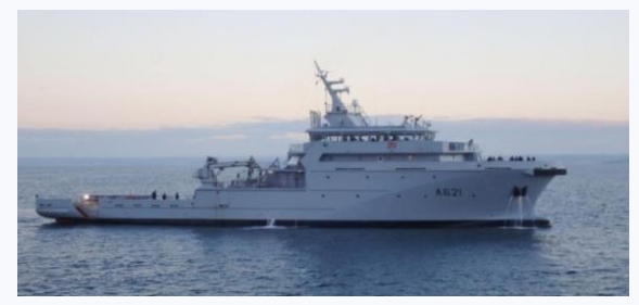
Morocco: Dar Al Beida