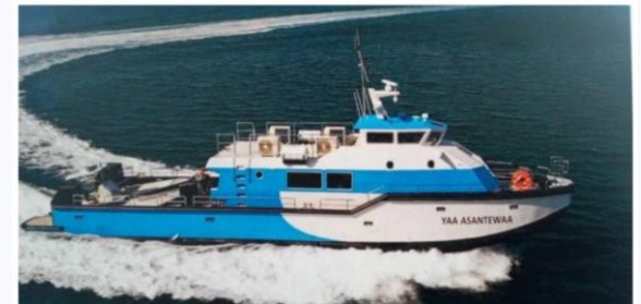
Ghana: Yaa Asantewaa