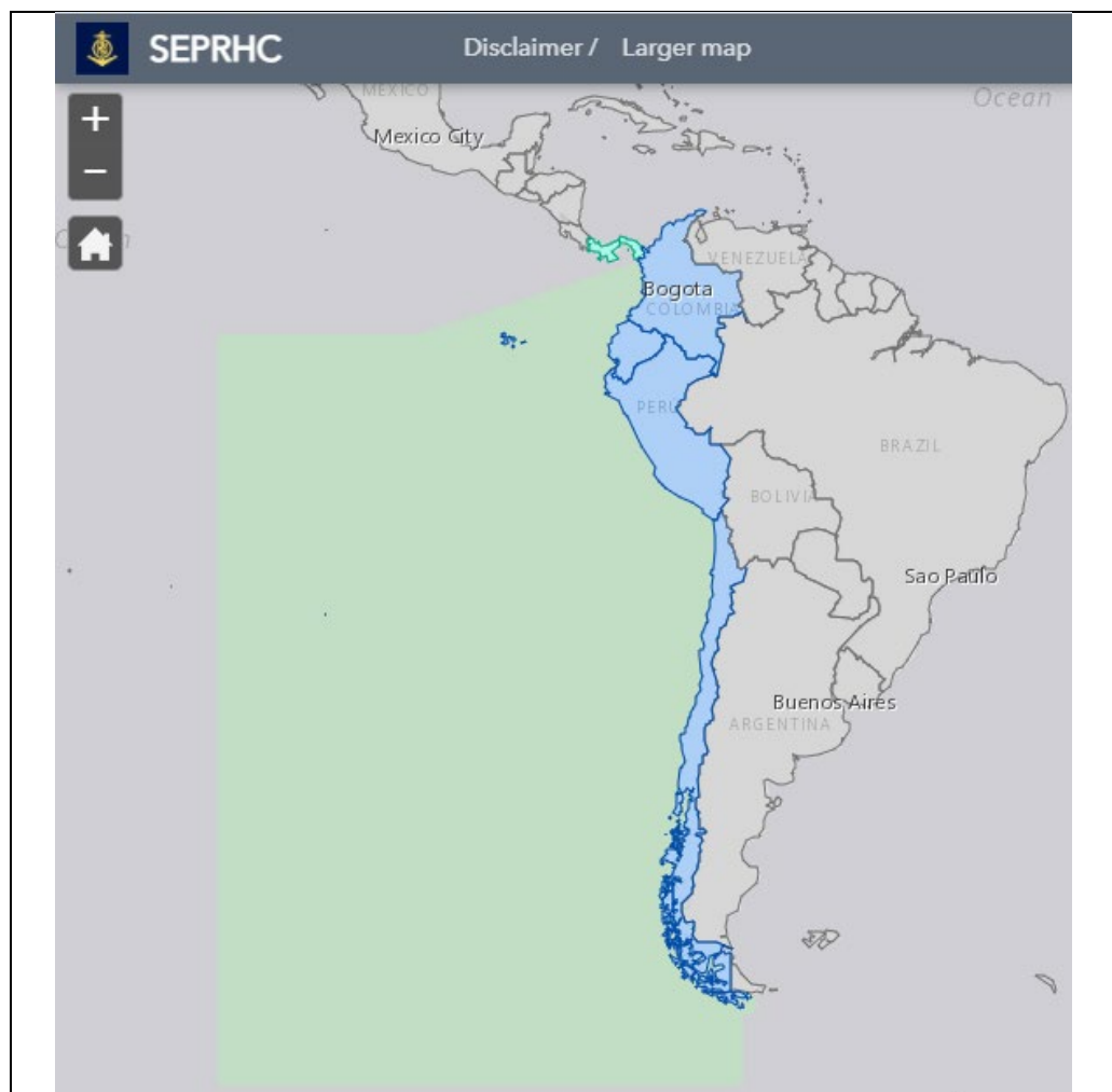
Figure 1.- Region and Commission country members

The Southeast Pacific Regional Hydrographic Commission is integrated by: Chile, Colombia, Ecuador and Peru, in addition to the participation of Panama, as an observer (Figure 1).