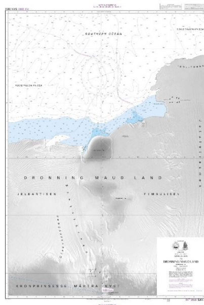
Figure 2. Paper Chart SAN 2004-INT 9056