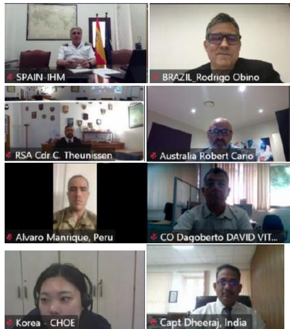
Some of the participants of HCA-18