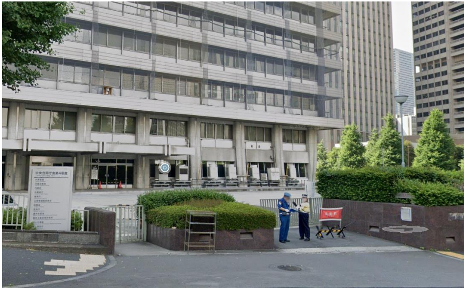
Entrance of the Central Government Building No.4

Your name and organization must be registered to the visitor list to enter into the building. Please inform JHOD your information at least one month before the meeting.