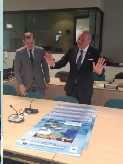
European Commissioner for Environment, Oceans and Fisheries, Mr Virginijus Sinkevičius and IHO Director Luigi Sinapi at the meeting, and for the signing of the commemorative poster for the 10 th Anniversary of the signature of the IHO-EU MoU.

The opening of the event concluded with the signing of a commemorative poster of the first 10 years of the signature of the MoU between the European Commission and IHO, and the intention to continue the activities of common interest for sustainable development of the seas of interest to the European Union.