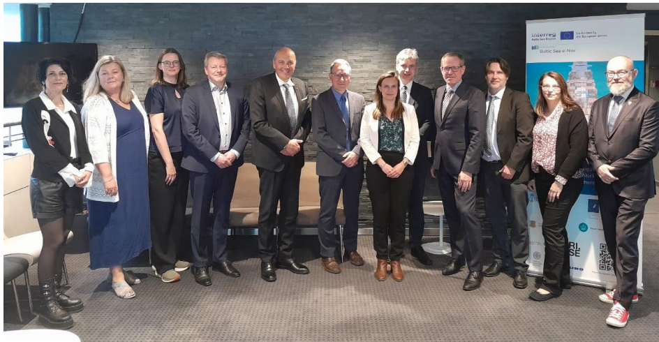
Participants at IENWG-14