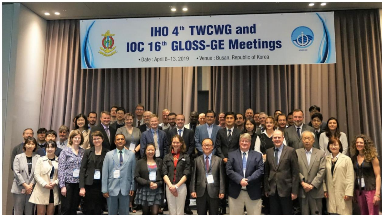
4 th meeting of the Tides, Water Level and Currents Working Group (TWCWG) Busan, Republic of Korea – 8-10 April 2019