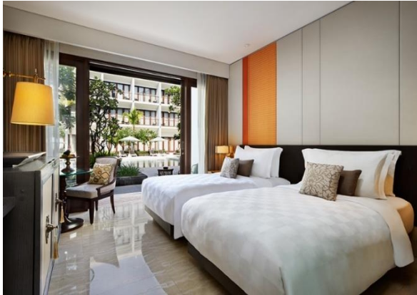
(Premiere room with direct pool access)

Facilities: Room size: 35,5 m 2 , 1 king bed or 2 single beds, free internet, free breakfast, mini bar, coffee and tea making facilities, and private balcony with garden view or direct pool access.