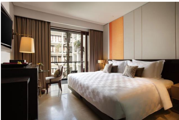
(Deluxe room on the upper floor)

Facilities: Room size: 30 mtr 2 , 1 king-size double bed or 2 single beds; free internet, free breakfast, mini bar, coffee and tea making facilities, private balcony.