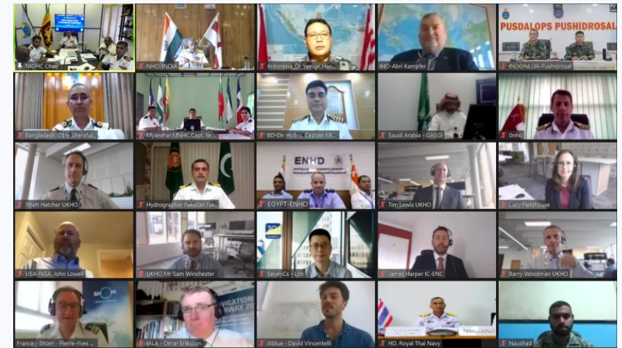
The 20 th NIOHC Conference