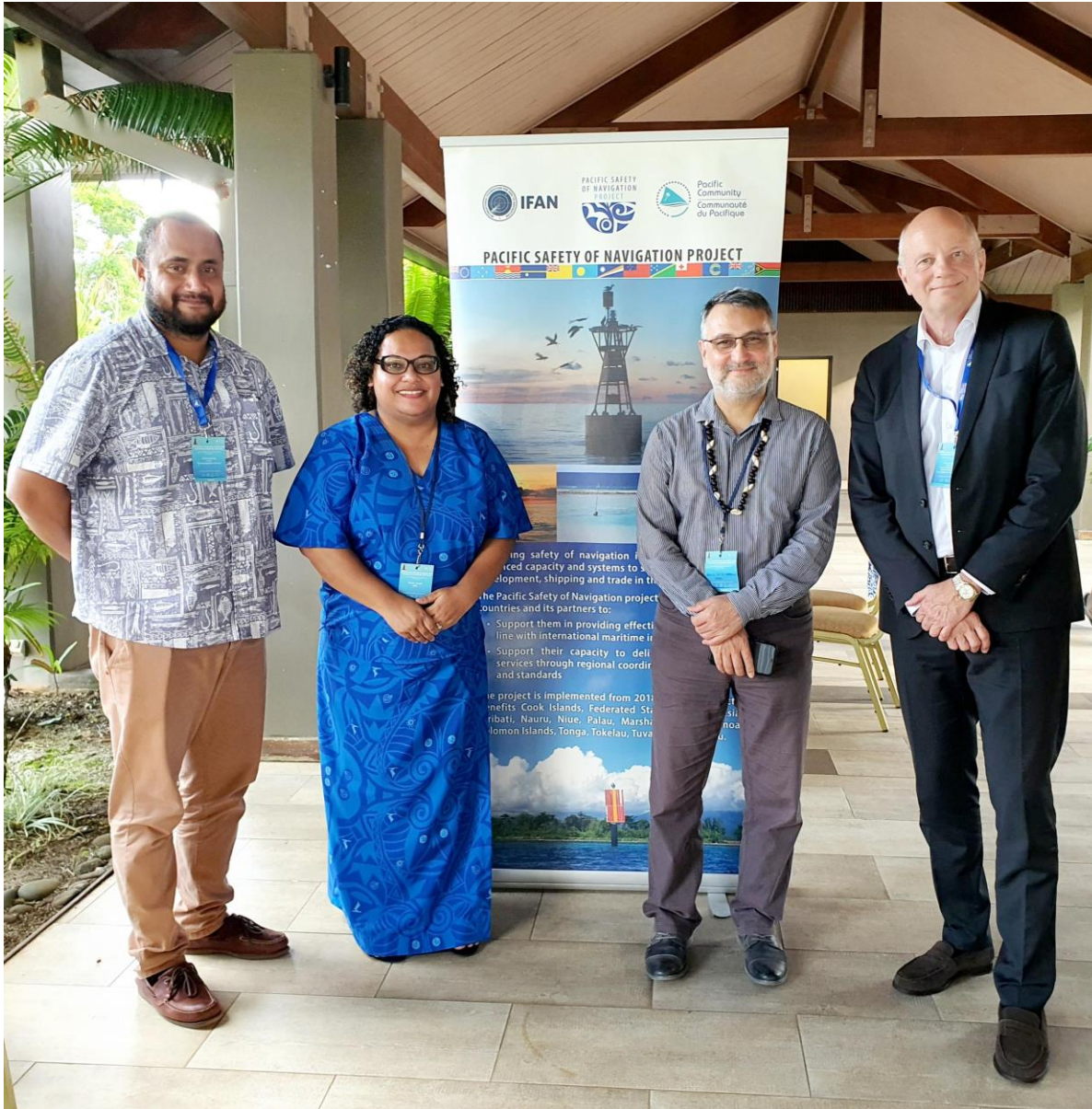
SWPHC (IHO), SPC, IMO and IALA