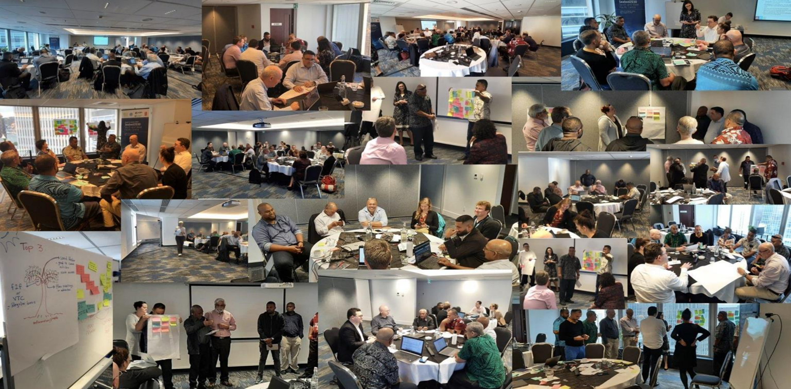
Technical Workshop on Hydrographic Governance 20-21 February 2023