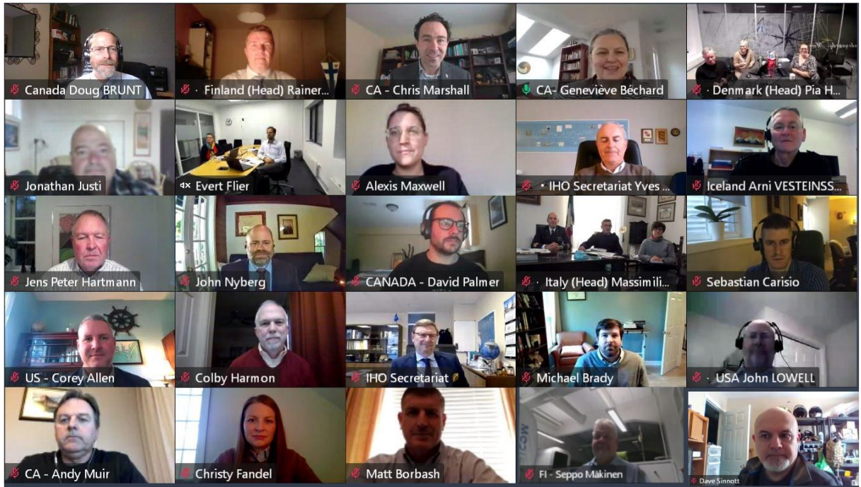
Some of the participants in the ARCH-11 VTC Meeting