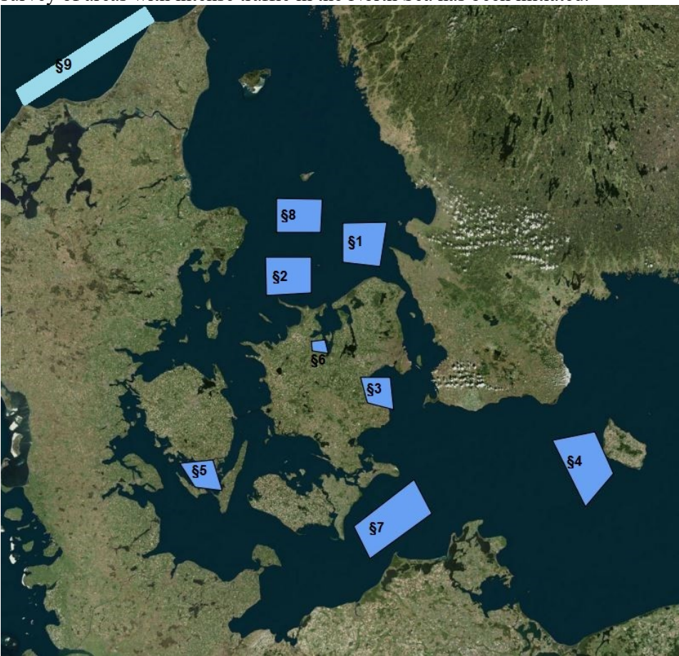
Figure 2. 2017 survey areas in Denmark.

The hydrographic surveys inside the Skaw are carried out in accordance with the HELCOM Copenhagen Declaration, adopted on 10 September 2001 by the HELCOM Ministerial Meeting. In addition, survey of areas with intense traffic in the North Sea has been initiated.