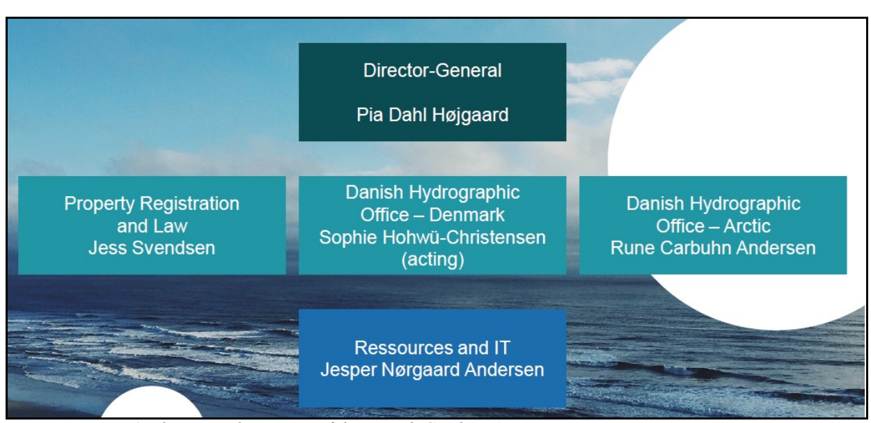
Figure 1. The internal structure of the Danish Geodata Agency