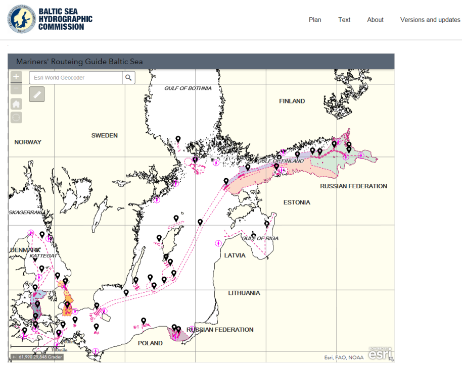
Figure 6. Mariners' Routeing Guide Baltic Sea

The web version is routinely updated with corrections published by BSH in Nachrichten für Seefahrer (NfS). "Versions and Updates" provides an overview of the corrections that have been added to the web version since the release of the latest printed version of the guide.