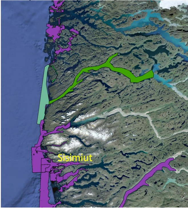
Figure 5. Survey areas in Greenland 2018

The surveys in the Greenland waters in 2018 will be a continuation of the re-surveying program of the inshore routes between ports in Greenland. Some near shore areas and fjords are being surveyed for the safety of cruise ships operating on the west coast.