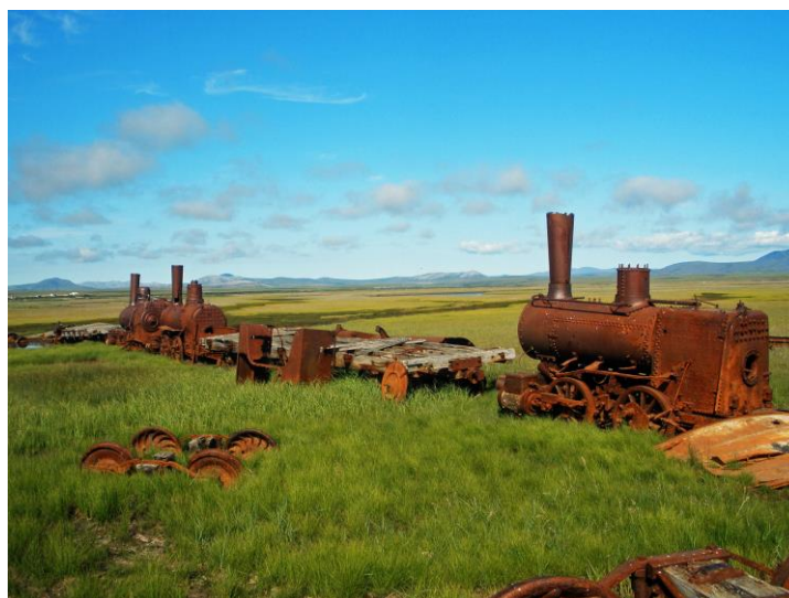
The "Last Train to Nowhere" in Nome, AK