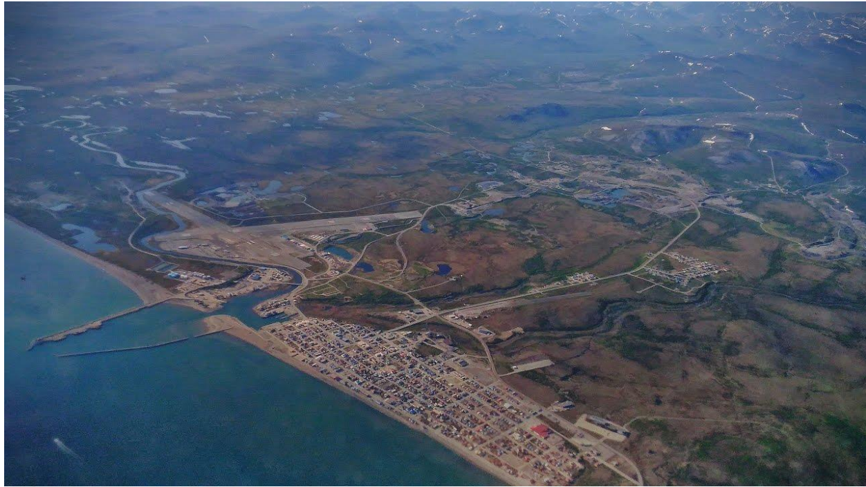
Aerial View of the City of Nome, looking towards the northwest