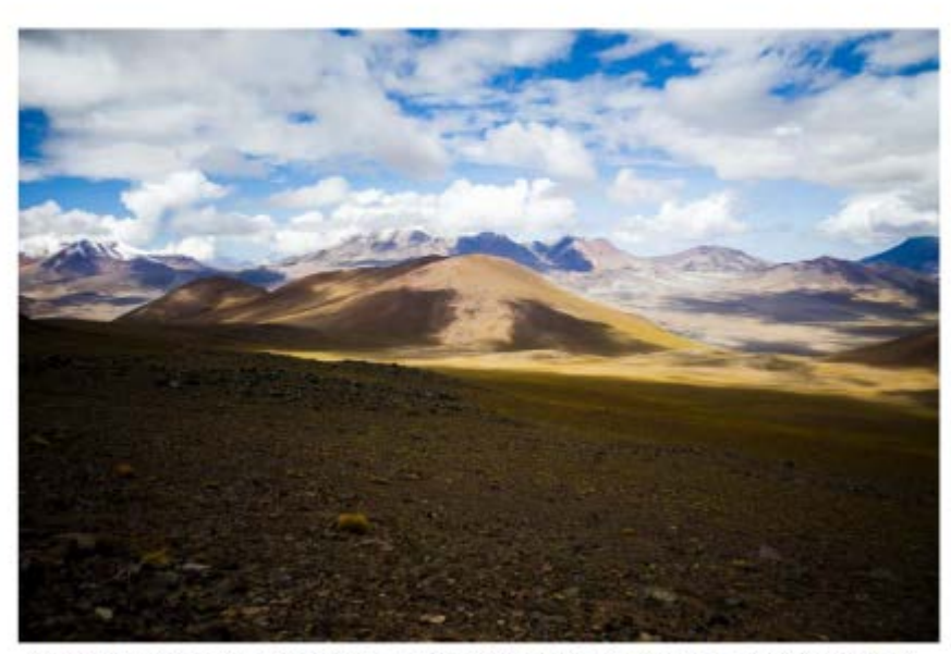
A view of the mountains of the Atacama desert, near the Siala river, at the border between Chile and Bolivia, on Jan 25