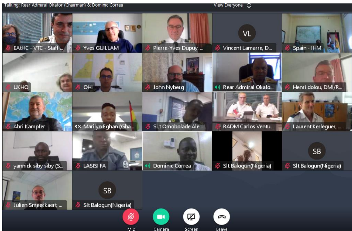
Participants of EAthC VTC 01&02 Events