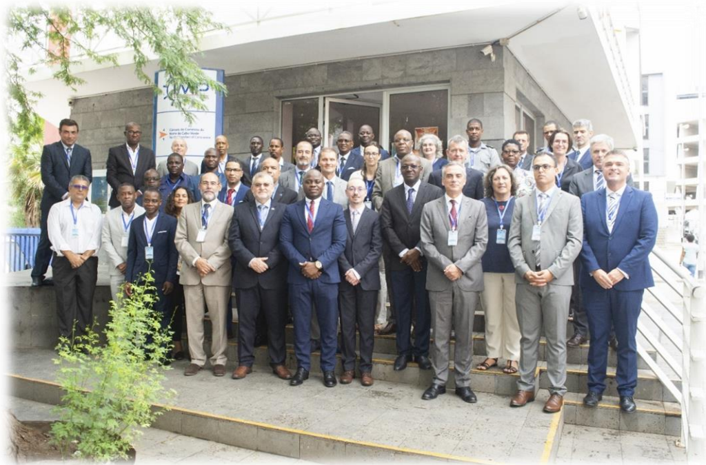
In-person participants of the 17 th Conference of the EAtHC