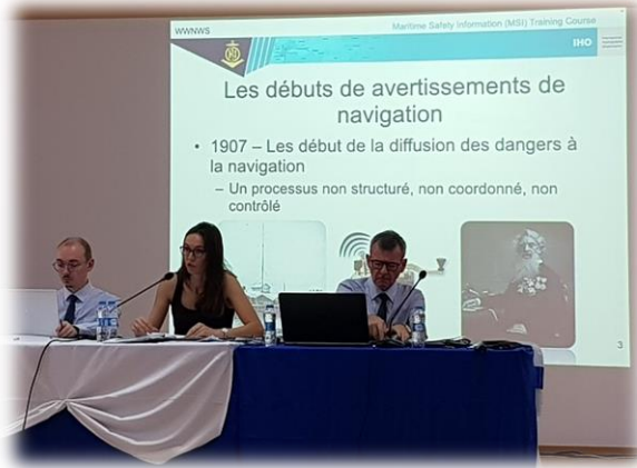
The NAVAREA II Coordinator (Shom, France) leading a session on navigational warnings