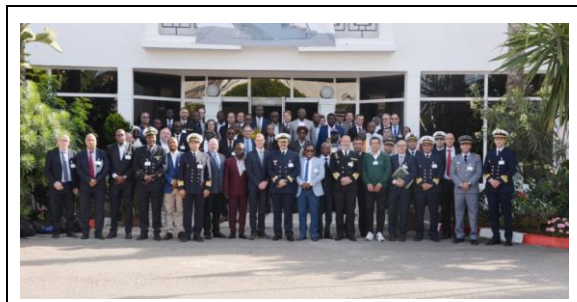
Eastern Atlantic Hydrographic Commission