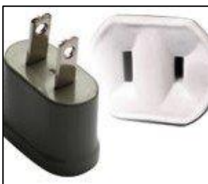
Type A: This socket has no alternative plugs

In Suriname the power plug sockets are of type A, B, C and F.