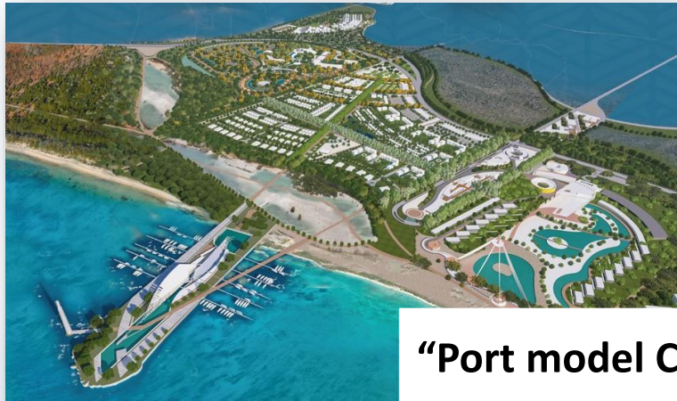
“Port model Cabo Rojo” Pedernales.