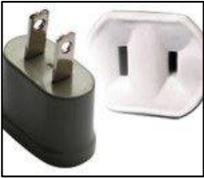
Type A: This socket has no alternative plugs

The standard voltage is 110 / 220V and the frequency is 60Hz. In Panama, the power plug sockets are of type A and B