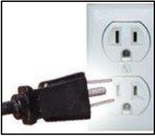
Type B: This socket also works with plug A