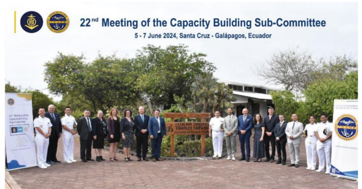
Participants at CBSC22 in Charles Darwin Research Station