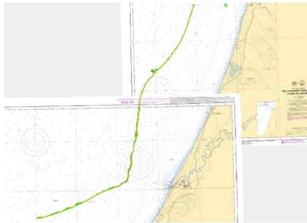
Figure 5: hydrographic survey between Larache and Safi