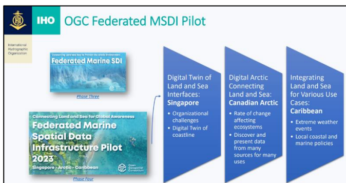
OGC federated MSDI pilot project – Figure 4

France presented a paper on “ WENDWG recommendation related to a new distribution model of the S-100 Phase I products and ENDS and decisions proposals ” to support the approach aimed at providing S-100 product coverage beyond the S-101 ENCs as soon as the first S-100 ECDIS is available. Because of their demonstrated robust role in the worldwide distribution of products on behalf of HOs, RENCs are key assets for the distribution of S-100. France highlighted the need to clarify what ENDS is and invited IRCC to request WENDWG to develop a new distribution model for S-100 products, in line with the HOs responsibility for the dissemination of nautical products to mariners under SOLAS convention. That dissemination of the S-100 products should build on RENCs, and the IHO Data Protection Scheme (S-100 Part 15) should be used to secure data integrity and retain the data producer signature all the way to the end user.