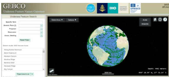
GEBCO Gazetteer – Figure 5

The DCDB Director reported on DCDB achievements over the last year. Today, the DCDB archives over 70 terabytes (TB) of uncompressed oceanic soundings acquired by hydrographic, oceanographic and other vessels during surveys or while on passage. Since June 2023, 93 new multibeam bathymetry surveys have been archived. The largest data providers to the DCDB continue to be the U.S. Academic Research Fleet (ARF) with 55 surveys archived in the last year.