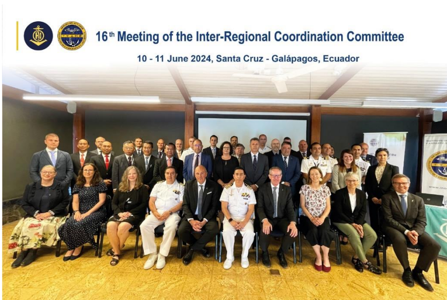
Participants at IRCC16 – Figure 1