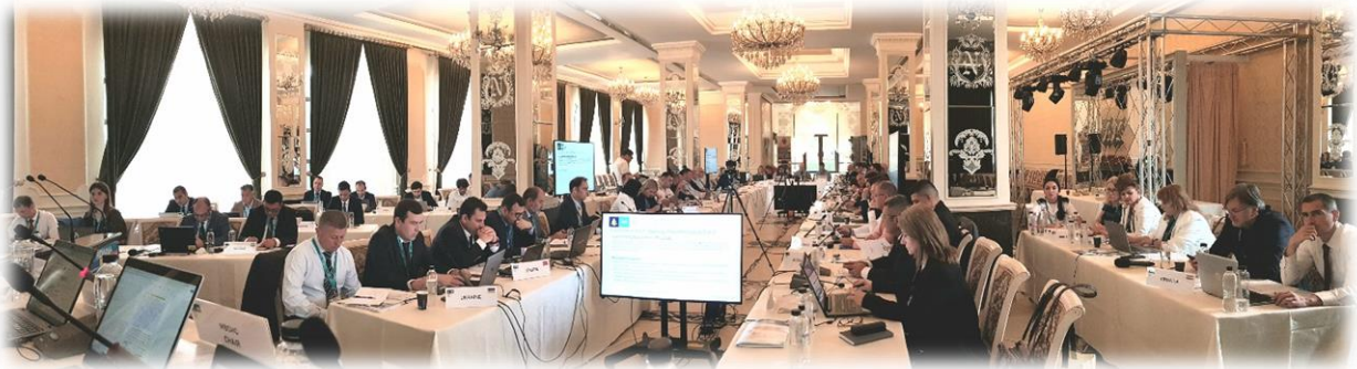
Participants in session at the 24 th Conference of the MBSHC – Figure 1

The Conference was preceded on 1 July, by successive working sessions led by the Chairs of the MBSHC Working Groups, aiming to finalize the recommendations and proposed actions to be presented at the plenary Conference for decision if appropriate.