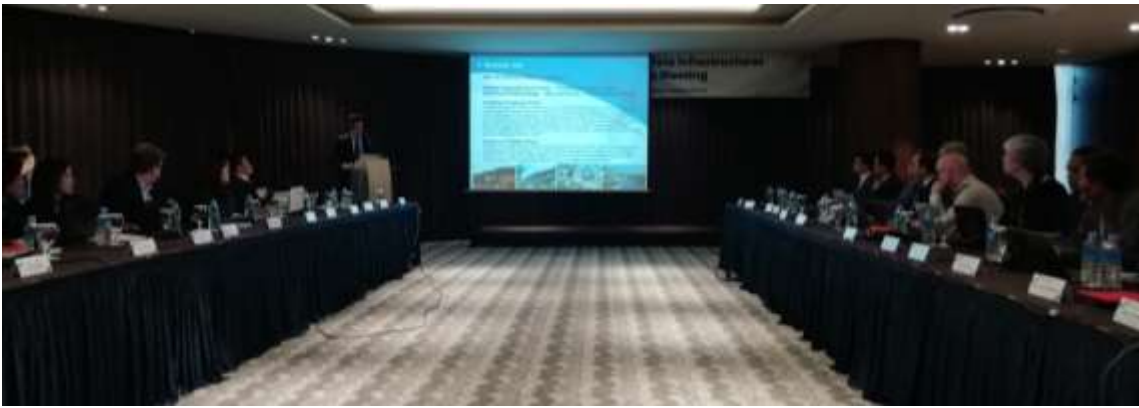
Figure 2. The IHO MSDIWG members attending the MSDIWG 10 meeting.

The IHO/MSDIWG will continue to facilitate a MSDI Open Forum which would allow non-MSDIWG stakeholders (e.g. RHC MS, government, academia, industry, funding bodies and NGOs) to attend to see what the MSDIWG and the commercial partners can offer. Attendees at the Open Forum would then be encouraged to stay on for the MSDIWG11 meeting. This approach is being developed in consultation with the hosts.