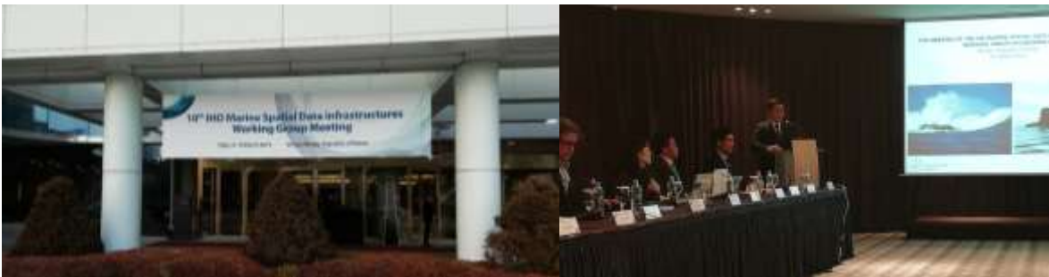
Figure 1. The IHO MSDIWG10 meeting in Busan.

The outcome of the meeting is available from the IRCC section of the IHO Website under the MSDIWG.