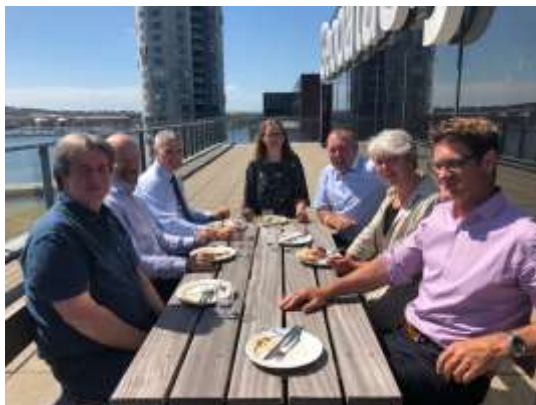
Figure 4. The BS-NSMSDIWG members attending the workshop.

Day 2 of the workshop the MS focused on reviewing the action plan and the way forward, updating the work program, and planed actions in order to address how the BSHC and NSHC can benefit from a regional approach to MSDI in the future.