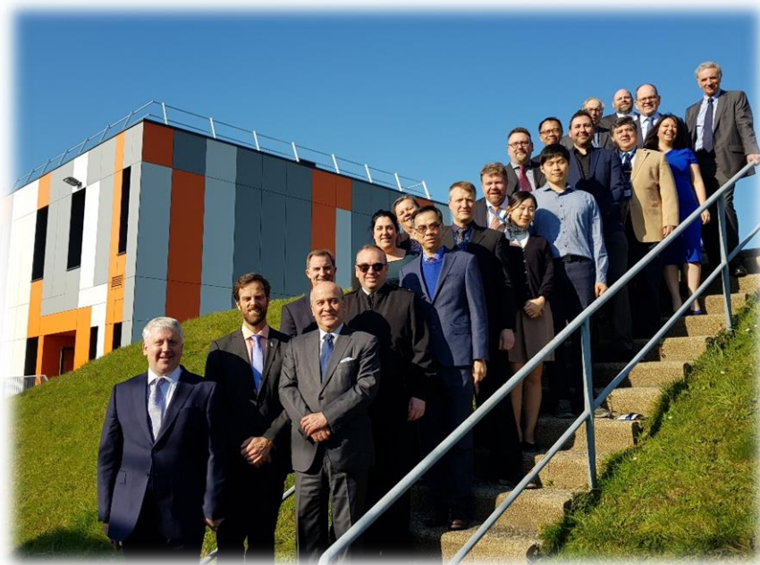
WENDWG-9 participants at Shom, Brest, France

The 10 th meeting of the WENDWG is scheduled to be held in Hong Kong, China, in February 2020.