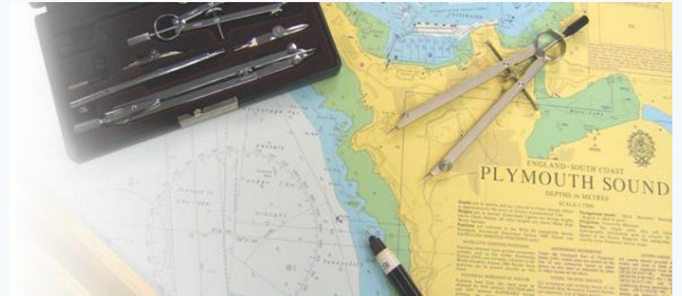
GB ENCs - Usage Band 1