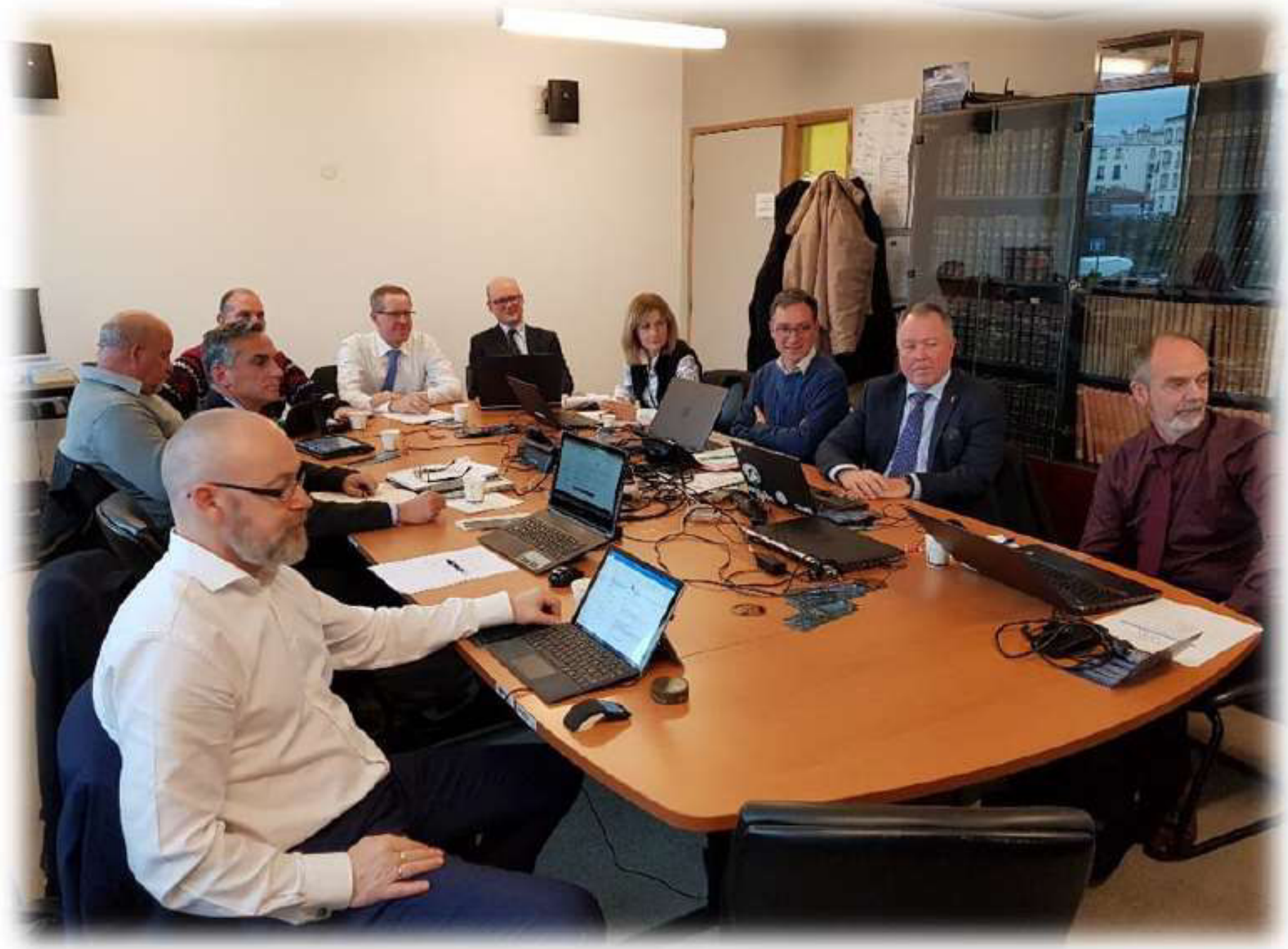
IENWG-10 participants in video-teleconference in Saint-Mandé, France