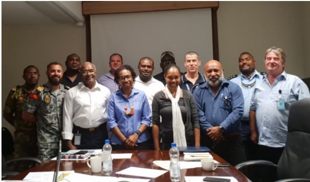
Committee Meeting 28 Aug 2018

NMSA hosted the national hydrographic meeting in Aug 18, to discuss status of hydrographic activities and priority areas for consideration. Outcomes from these meetings considered in the Hydroscheme of the AHO.