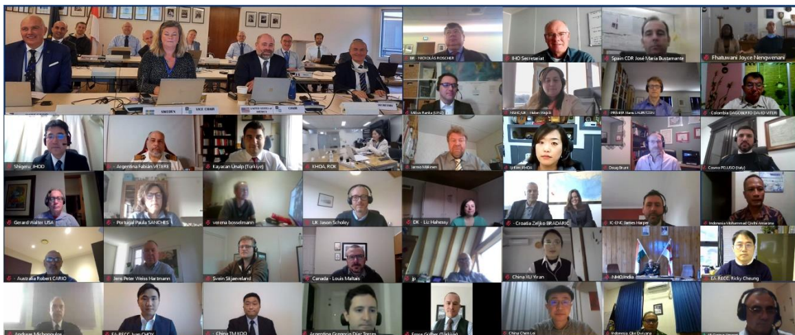
Some participants of the WENDWG12 hybrid meeting.