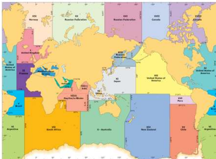
Figure 5-3: METAREAs for coordinating and promulgating meteorological warnings and forecasts under the World-Wide Met-Ocean Information and Warnings Service